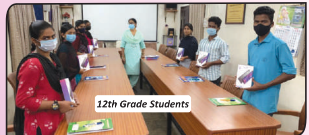
12th Grade Students