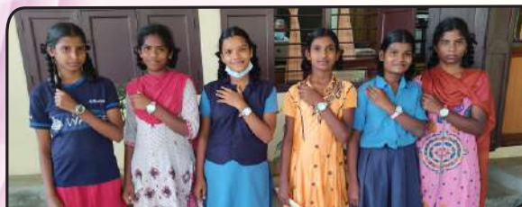
Girls are gifted with wrist watches and smiles

Log on to www.amazon.in —click ‘wish list’ at the right top corner - enter ‘Mudhiyor Balar Kudumba Grama Pannai,’ and you will find items for the children and elders.