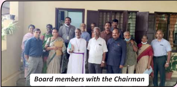
Board members with the Chairman