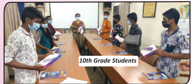
10th Grade Students

MBKG Pannai was selected as one of the beneficiaries after validation by the Delivering Smiles programme team through the Give India Foundation. The Programme supports our children's online learning needs through their gifts of Mobile Phones, Tablets, Laptops, and All in One Computers.