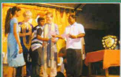
Annual Day Celebration