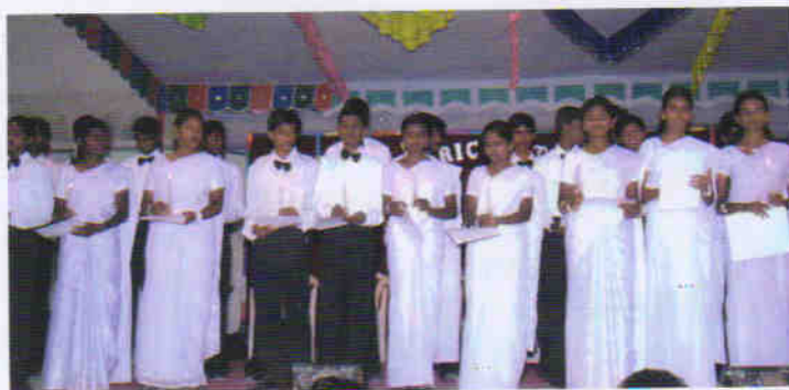
Graduation of 10th Std Students (2008-2009) Batch