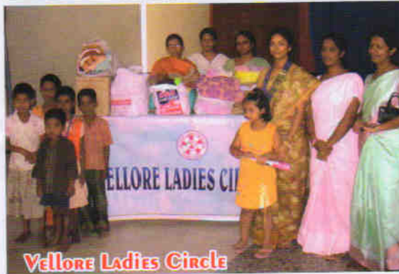
Vellore Ladies Circle