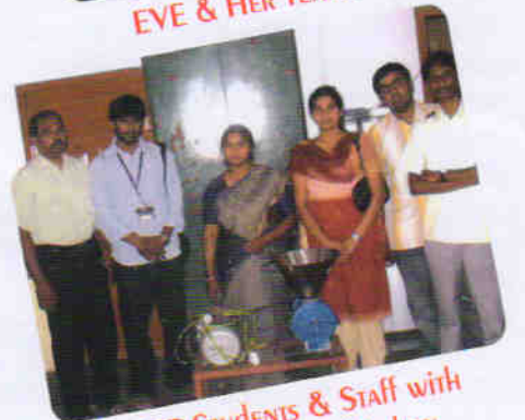
VIT STUDENTS & STAFF WITH THEIR GIFT FOR KITCHEN