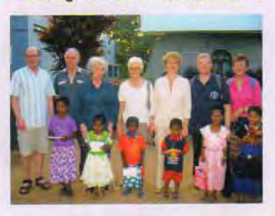
Alrestord Sponsors with their Sponsored Children