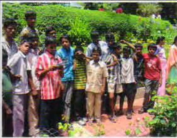
Boys' at Kodaikannal