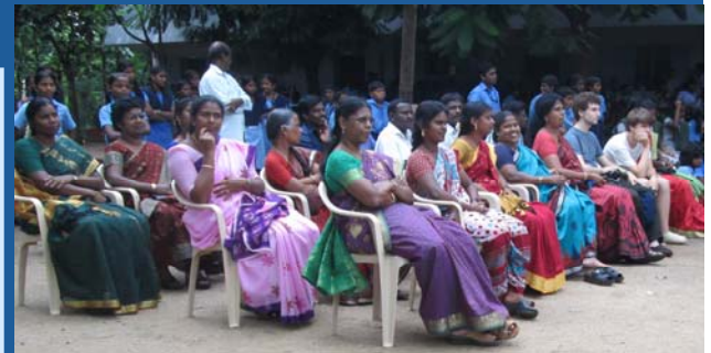
Children entertaining their teachers

To commemorate Teachers' Day this year, the students, in a gesture of gratitude, put up a cultural program of performances dedicated to their hard-working teachers. The atmosphere was a joyous one, students and teachers alike enjoyed the opportunity to appreciate each other in ways that the classroom environment often does not allow for. So much enthusiasm and fun made for a great celebration. A small gift was given to the teachers as a token of thanks for all the effort and time they put in throughout the year to deliver the high standards of education that our students obviously en-