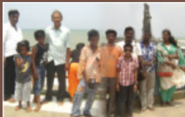
Staff Picnic at Cape

With the encouragement, effort and dedication of teachers and the hard work and enthusiasm of students, we have achieved 90% results this year. As our school has been upgraded to higher secondary, 22 students have been enrolled into our new 11 th standard.