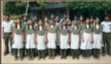
11 th Grade Students