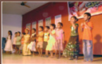
VBS - 2011