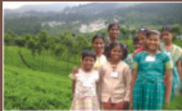
Annual Camp 2011