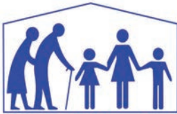
Mudhiyor Balar Kudumba Grama Pannai

Now may He who supplies seed to the sower and bread for food, supply and multiply the seed you have sown and increase the fruits of your righteousness, while you are enriched in everything for all liberality, which causes thanksgiving through us to God. 2 Cor 9:10,11