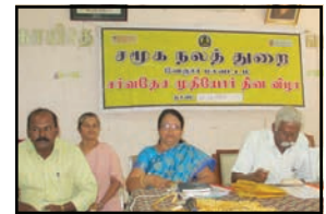
District Social Welfare Officer

To commemorate World Elderly Day, the elders from various homes around the district were honored at the collectorate on December 26th, organized by the District Social Welfare Board. Our grandparents were also taken to the event. Various competitions were conducted and winners were awarded. Even a blood pressure check was done for them. The programme was followed by lunch. It was a memorable day out for our elders.