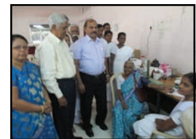
Blood Pressure Check