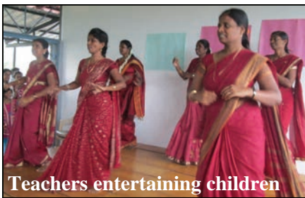
Teachers entertaining children

In commemoration of the World Diabetes Day 2014, Christian Medical College and Hospital, Vellore, Conducted an essay writing and painting competition for the students of class IX, X and XII among the schools of Vellore on 22 Nov 2014. Our IX and X grade students participated in both competitions and received certificates.