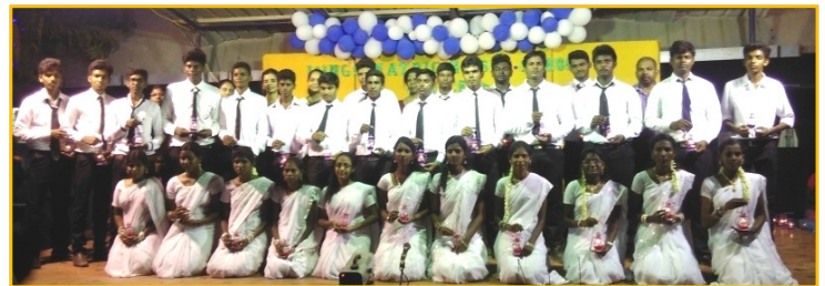
Students of Class 12