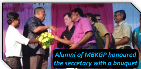
Alumni of MBKGP honoured the secretary with a bouquet