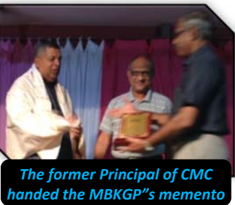
The former Principal of CMC handed the MBKGP's memento