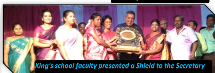
King's school faculty presented a Shield to the Secretary

The organization continues to hold the status of the best "Integrated Complex of Special Homes for Senior Citizens and Destitute Children" in the district awarded by the state government of Tamil Nadu.