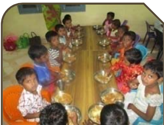
Children relishing on their favourite food.....Parota with Chicken curry

Thanks to people who chose to celebrate their Birthdays, Anniversaries and Thanksgiving with the children and the elders by sponsoring special meals and snacks