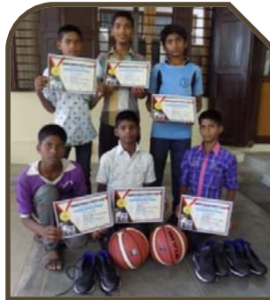
Boys pose with their certificates and the Sports equipment that they received through "Gift a Smile programme".